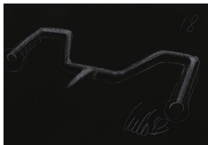
picture: Colani handlebar

■ Wilhelm Humpert GmbH & Co. KG Erlenstraße 25 58739 Wickede / Ruhr - Germany